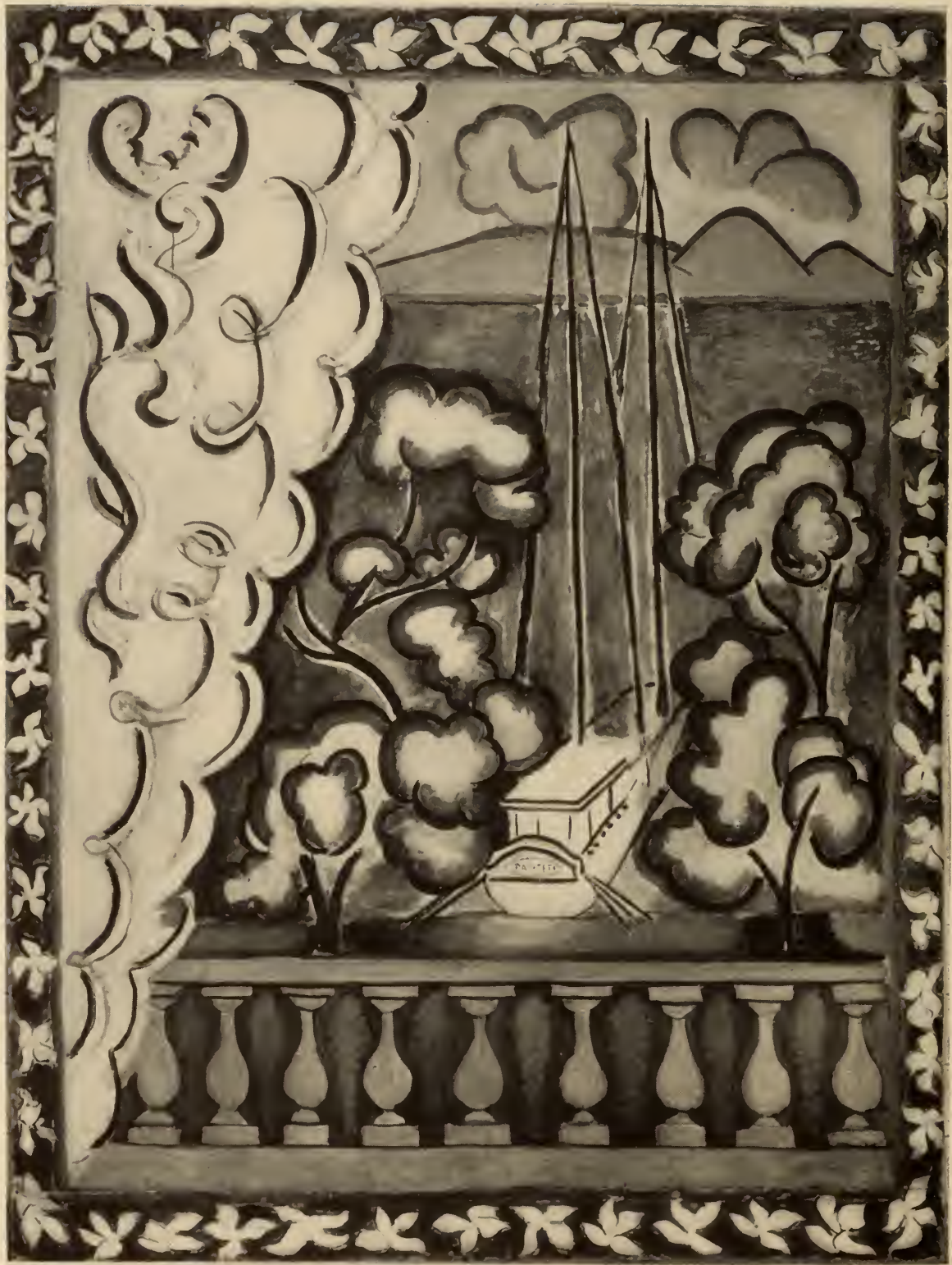
HENRI-MATISSE — “Papeete”